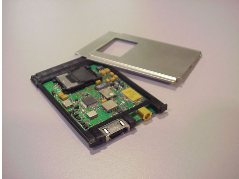
PCMCIA GPRS card

Manufacturing and test development engineers provide hands on engineering support, to ensure successful product roll-out.